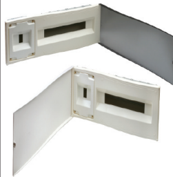
Reversible windows in opaque and transparent version