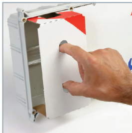
Punched packing boxes to be used for masking the enclosure during its installation on walls